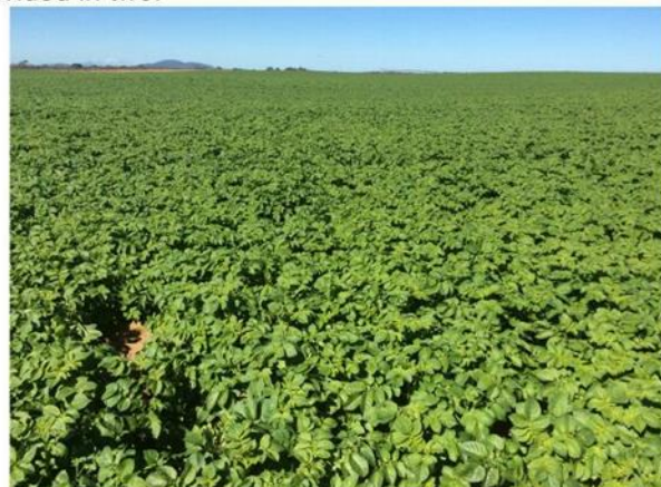
Trial - Penergetic P Bentonite, G, C, H+