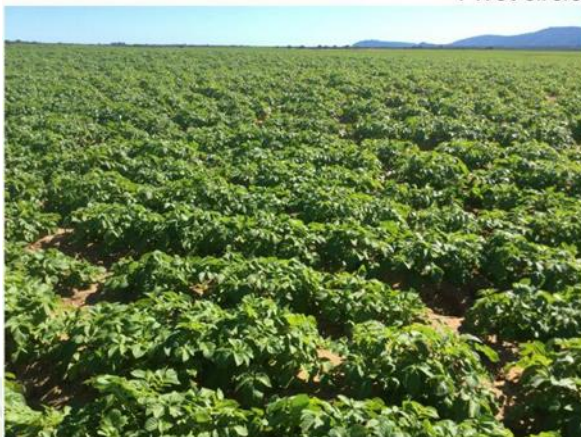
Control - sprayed with competitor's products