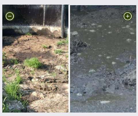
Strong floating crusts Dissolving of floating crusts and elimination of strong odour