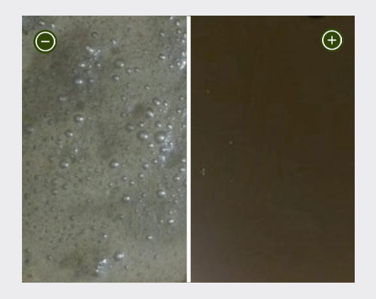
Improved pig farming and manure Homogeneous liquid manure, odour reduction and reduced mortality