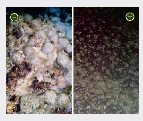
Thick fertilizer sludge and a putrid smell Dissolution and improvement after 1 year of Penergelic use