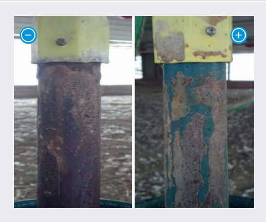
Sediments on water pipe 40 days after installation, sediments visibly decreased.