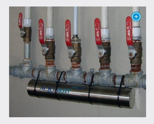
Installation of AquaKat in dairy farm More water consumption of the animals and an increased milk production.