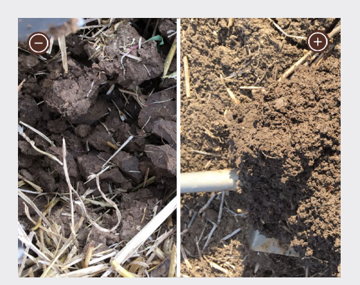
Soil improvement Compacted soil gives way to a loose soil structure.

Increase of the average phosphorus content.